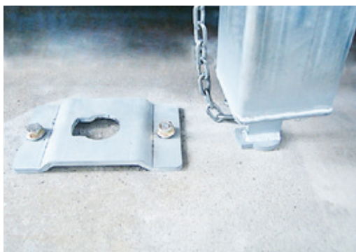
Locking Base Plate Fix to Floor