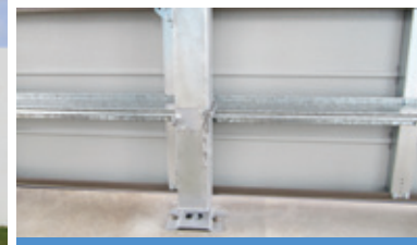
Heavy Duty Wind Brace Post

Superior strength and rigidity are qualities of the unique design of the Steel-Line Wind Brace system for sectional garage doors used in high wind and cyclonic locations.