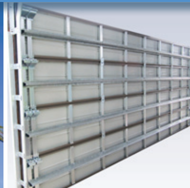
Internal View without Brace