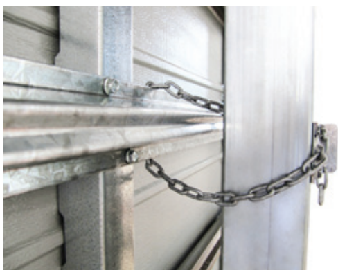
Typical Post to Strut Connection Details